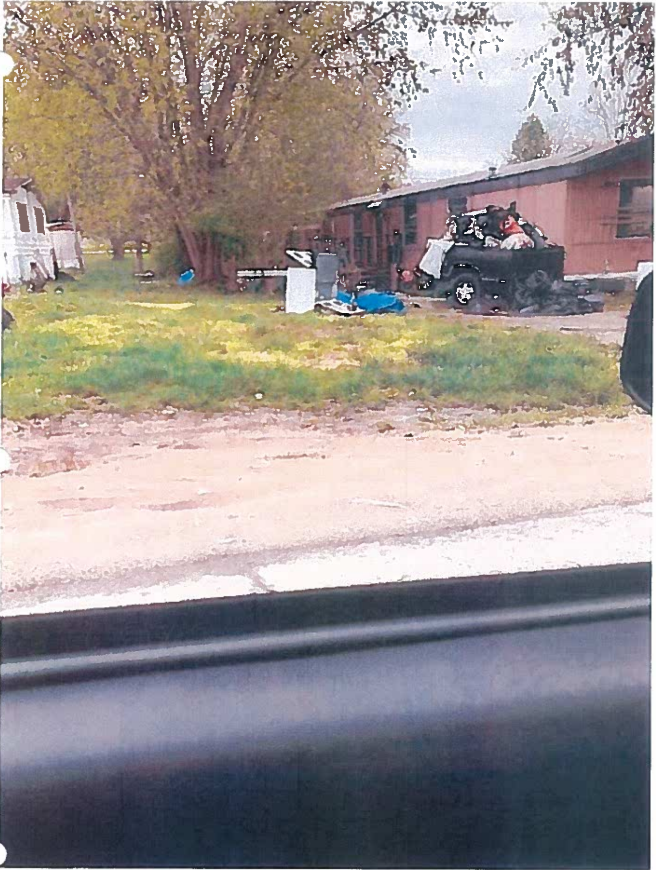
6789/6791 Heather Maxx Trail CH